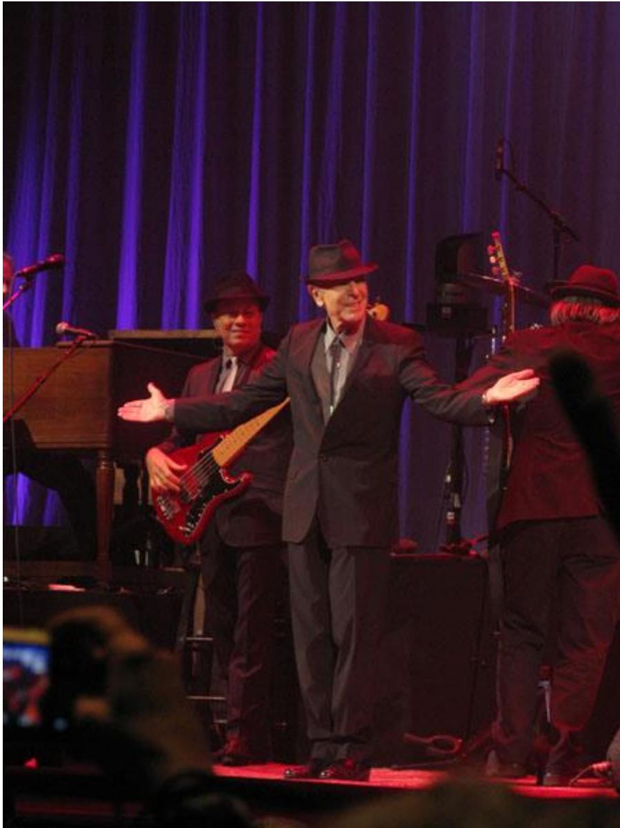
A final farewell

Although he has gone through the routine and patter on over 300 occasions these past years the Leonard Cohen we see before us on stage comes across as 110% genuine, sincere and grateful to his audiences for sticking with him. He is humble, gracious and self deprecating. He addresses his audience as Friends, he thanks them for coming and he thanks them for their support and this is because he knows you pass the same people going down that you pass as you go up and he has had plenty of ups and downs.