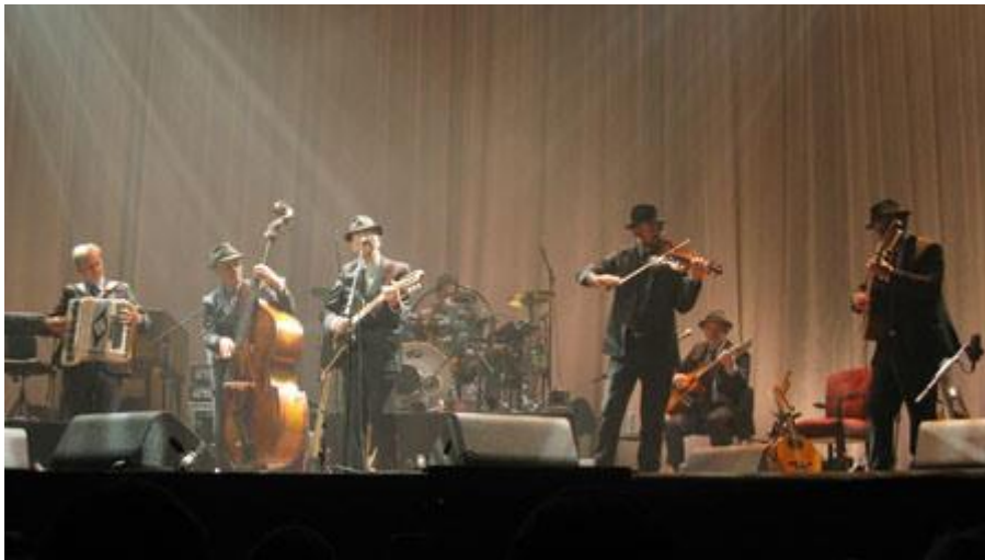
The Partisan – a highlight of each concert

I have seen all of these artists perform including Neil Young, Paul Simon and Bruce Springsteen in recent years and none come close to delivering a performance as memorable as an evening with Leonard Cohen that unfailingly, night after night, leaves the audience feeling they have been privileged to be in the presence of a genius. Springsteen puts on a good show and Neil Young, interestingly enough a fellow Canadian, always delivers a great performance and is uniquely the one artist who is always challenging himself, being continuously innovative and courageously never afraid to make mistakes.