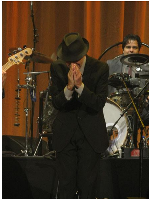
Thanking the audience