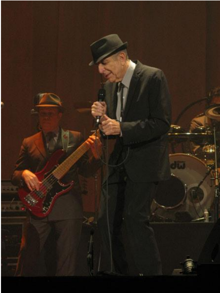
A man at peace with what he is doing

In Montreal he thanks the audience for staying after the intermission and earlier when he described how he struggles out of bed in the morning, wanders across the room to find the mirror, stares into it and poking fun at his own reputation comments to his reflection in the mirror 'Lighten up Cohen.....'