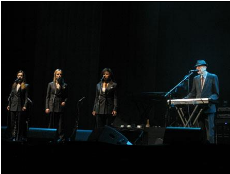
Tower of Song

This oft repeated comment dates from his early reputation based on the content of his first three albums in particular and often overlooks the fact that those same albums contained tunes such as Suzanne, Bird on the Wire and Sisters of Mercy that are now established classics of the 20 th Century Songbook. Nevertheless the reputation has accompanied Cohen throughout his career so it is ironic that his concerts are such an positive and uplifting experience as well as a testimony to musical excellence.