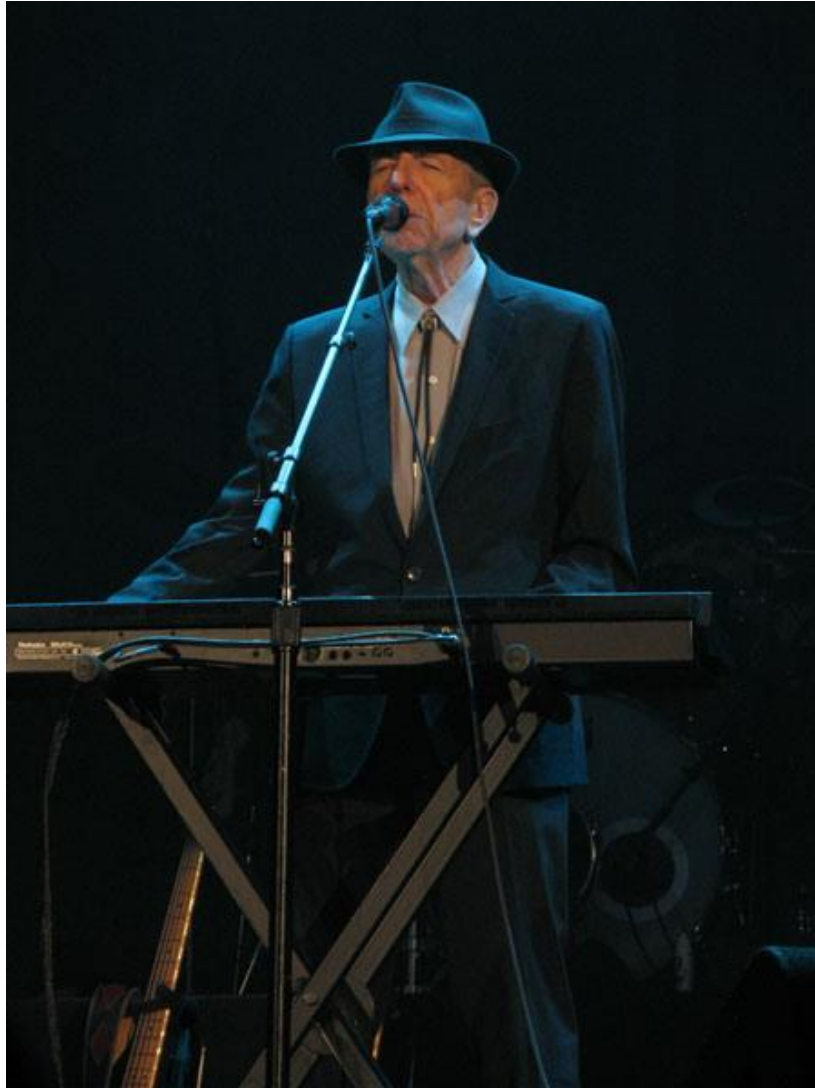
'You may not have seen one of these before'

It is not because (wherever the venue) the sound quality is consistently outstanding with the technicians ensuring that the balance between the voices and instruments is always complementary and neither dominates the other. Indeed every word that Cohen sings is clearly audible which of course is no less than what a poet and writer deserves!