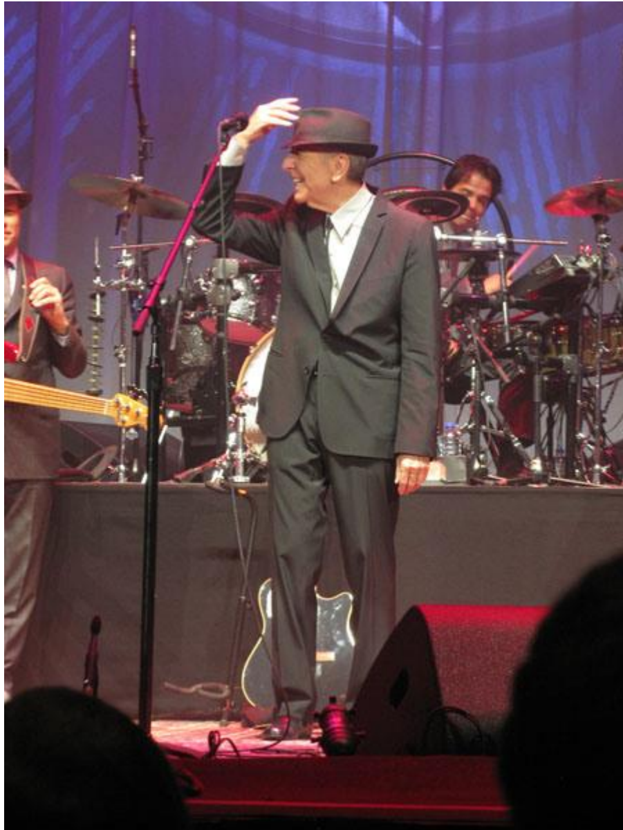
Just working for your smile