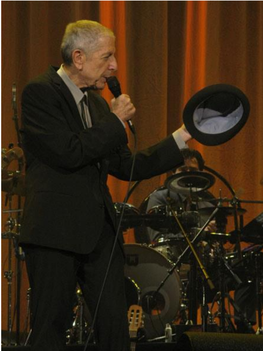
Acknowledging the band