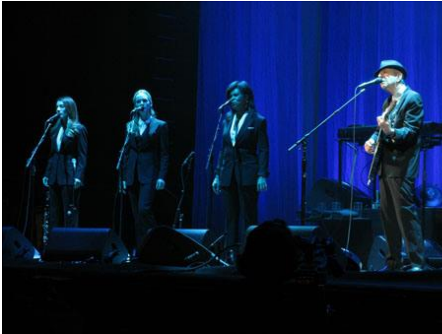
Famous Blue Raincoat

centigrade cold eventually drove us inside for some French Onion soup and hot chocolate. And on the Monday before leaving Quebec we walked along the Terrace atop North America's only fortified city walls and ascended the 300 plus steps to the Plains of Abraham on Cap Diamont. I remembered being taught about General Wolfe scaling the Heights of Abraham and defeating the French in 1759 which was the beginning of the end of French rule in Canada almost 50 years ago! We returned to the hotel after walking around the Citadelle, a military installation that is one of the official residences of Canada's Governor General. The Citadelle is part of the fortifications of Quebec City which has been designated as a World heritage site since 1985. We planned to spend some of our time in Quebec in warm cinemas catching up on the latest releases until we discovered that unlike Montreal there were no 'Version Original' (ie English) films showing in strongly Francophile Quebec City and the movies were all dubbed into French so when rain set in on the milder Sunday I spent the best part of a day and a half in our hotel room attempting to synchronise two Iphones to one Itunes account!