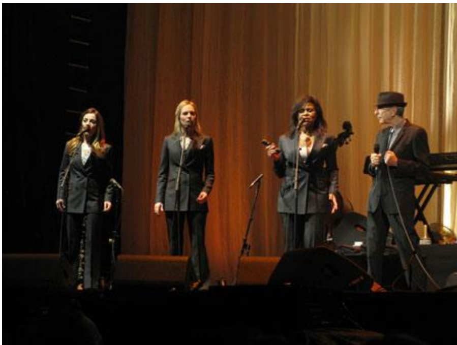
Leonard and his girls

Firstly I must declare an interest – as for many others Leonard Cohen has long been both an idol and an icon for me and his music has accompanied me through life's journeys since I first played his debut LP 'The Songs of Leonard Cohen' back in 1967. Since Leonard resumed performing in 2008 I have attended 30 of the 300 concerts he has performed.